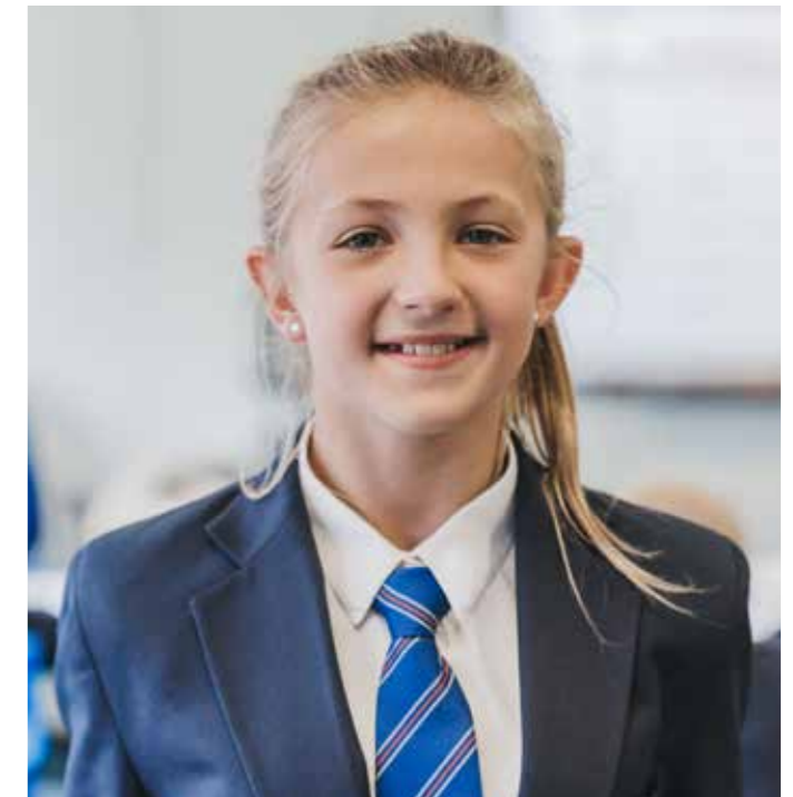
Carleton High School new uniform 2018

Students who consistently meet these expectations, produce something exceptional or go the extra mile receive Epraise points, and the more of these they receive the more prizes and certificates they qualify for. Every half term there is a rewards assembly, which helps to create a really positive culture.